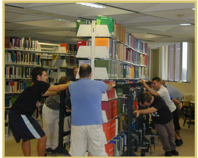
A large range of stacks being moved as part of the new carpet project.

New carpet was installed in the public areas of the fourth and fifth floors of the 1968 building. That carpet had been damaged in October 2006 by water from a burst pipe in the penthouse which also caused extensive damage to the collections on the fourth and fifth floors.