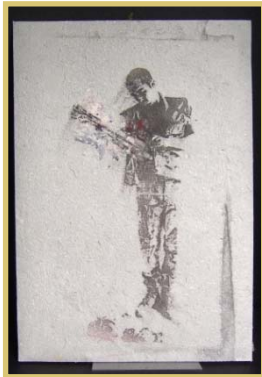
Combat Paper , a book art protesting the Iraq War, is a collaborative effort between the People's Republic of Paper and members of Iraq Veterans Against the War. The book is actually an envelope containing several pages of handmade paper created from the uniforms of veterans who served in the war.

More unique university publications became accessible as the project to fully catalog this collection in Special Collections and University Archives continued. The following were cataloged: FTU/UCF Press Releases, FTU/UCF Financial Reports, FTU/UCF employee, faculty and staff handbooks, and FTU/UCF Office of Research and Office of Graduate Studies annual reports.