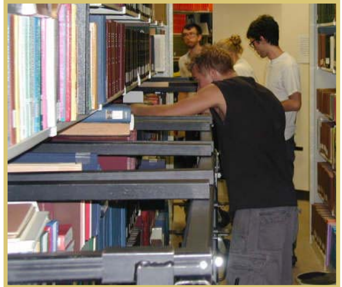
The Stacks carpet project team place the stacks mover into position.

New carpeting was installed in the public areas of the fifth floor and also in the "old building" sections on the fourth floor over this academic year. In order to accommodate removal of the old