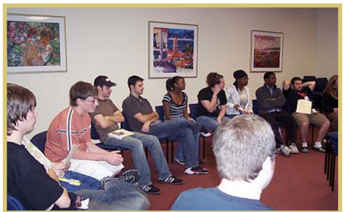
Circulation Services student assistants attend training and teambuilding sessions.

Since the stacks were already being relocated for the carpet project, and to make more efficient use